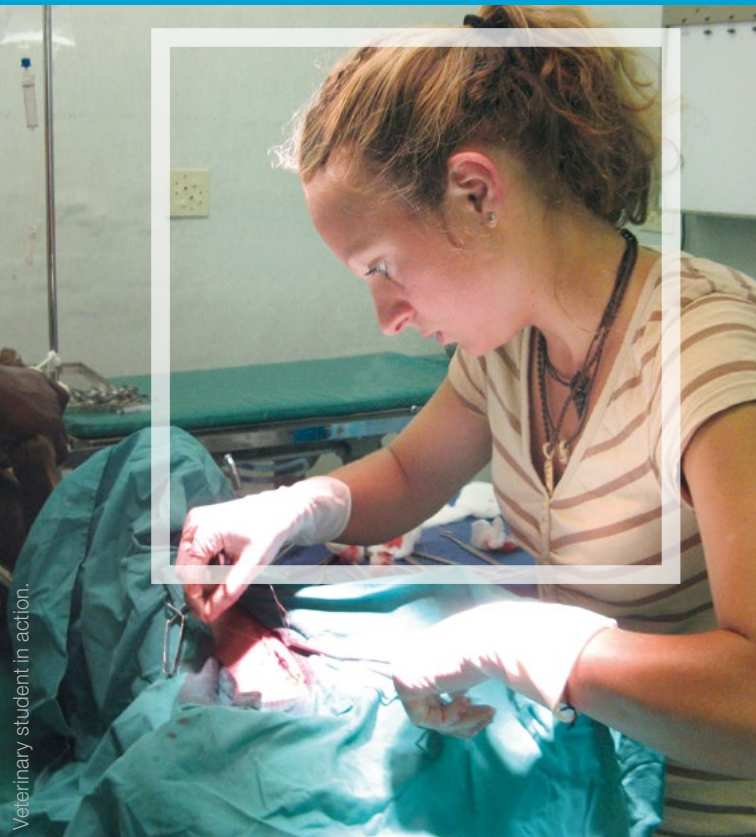
Veterinary student in action.